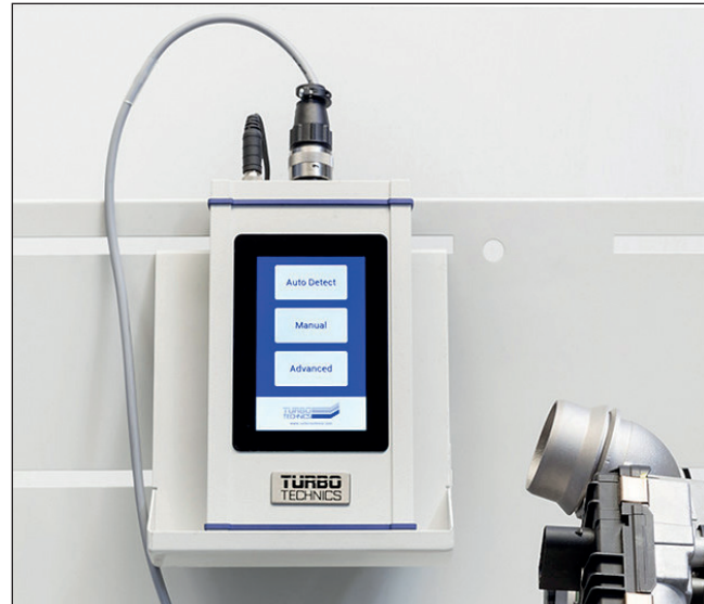
Optional ATP100 electronic actuator tester